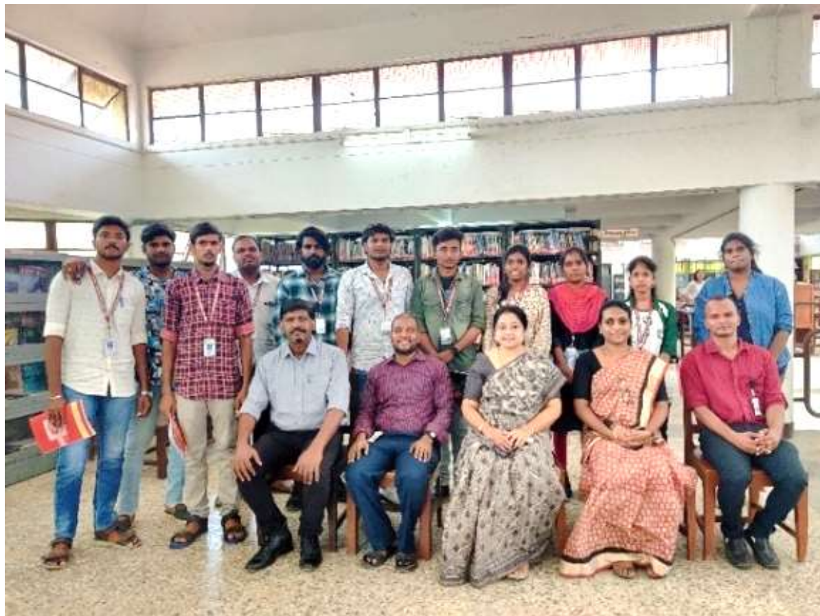
II MA English Students of Voorhees College, Vellore, at the Miller Memorial Library