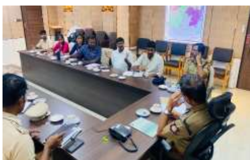
On 14 th July 2023, Project Orientation for the