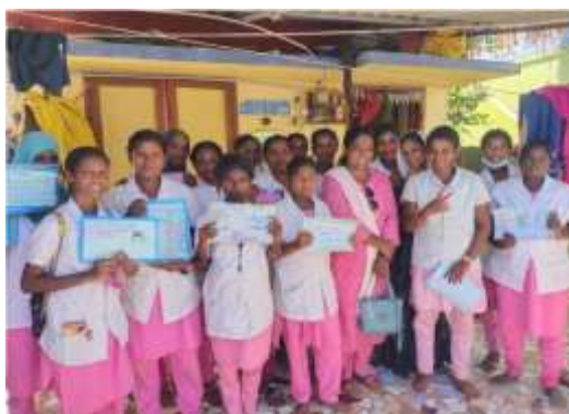
Hospital Visit – Sai Bhavani Hospital