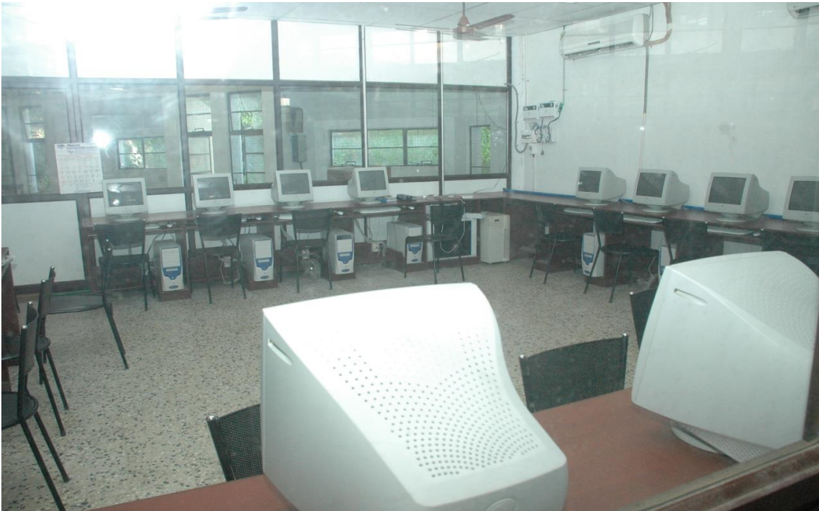
Computer center facility