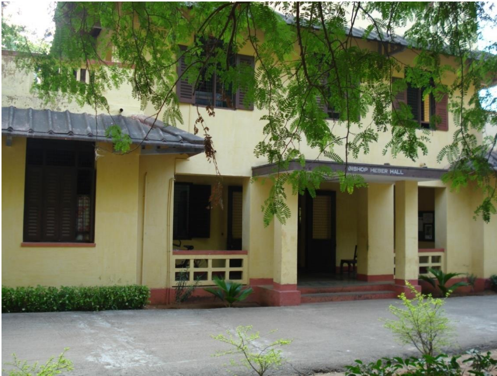
Bishop Heber Hall