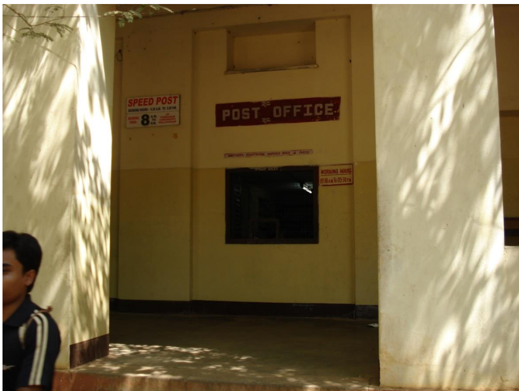
Post Office Facility