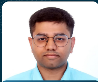
A HUSSAIN AIR 845