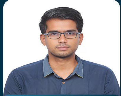
KATHIRAVAN AIR 573