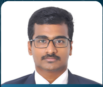
PRASANNA AIR 608