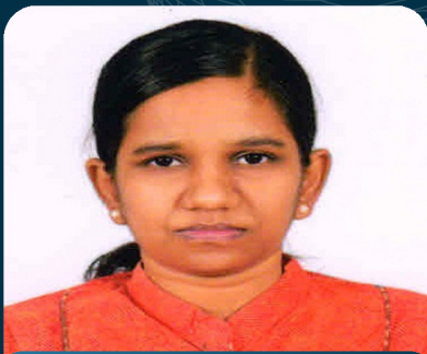
OVIYA AIR 796