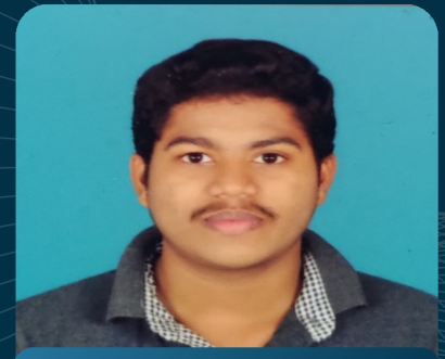
VINOTH AIR 683