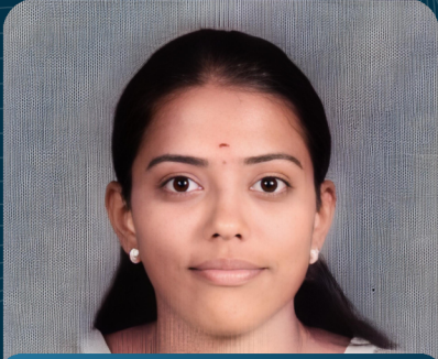
DHARANI AIR 250