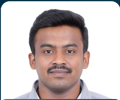
RUTHERSON AIR 598